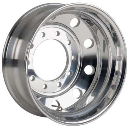
Retro Fit Alloy Hino Truck

Short (front) and long (rear) sleeved retro truck wheel nuts are available from Mullins wheels for most popular “Retro-Fit” applications. For the correct torque setting for your wheels you should refer to the recommended setting as published by your truck / trailer or axle manufacturer.